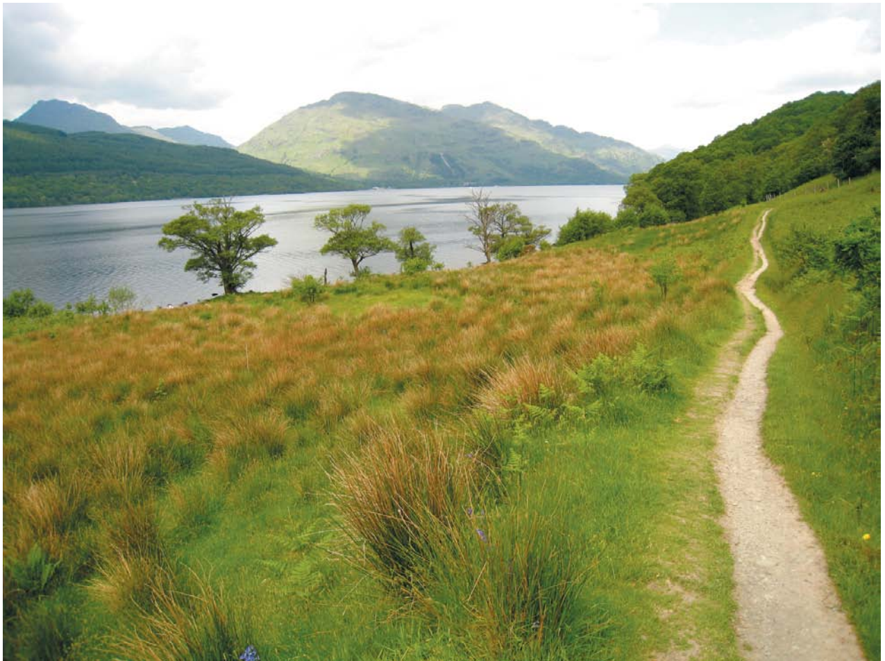
West Highland Way, Scotland